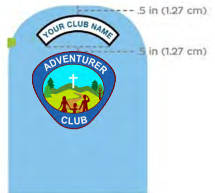
Right Sleeve for ADVENTURERS