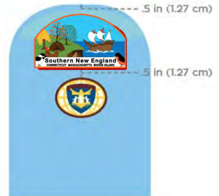
Left Sleeve for ADVENTURERS WITH CONFERENCE PATCH