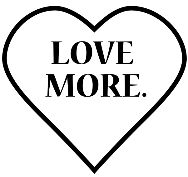
More of God. Less of Me. All of Us.