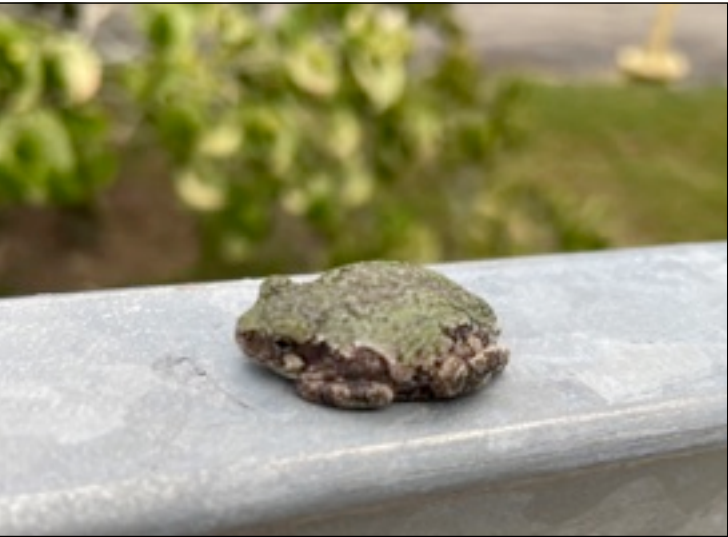
A recent visitor to the church.