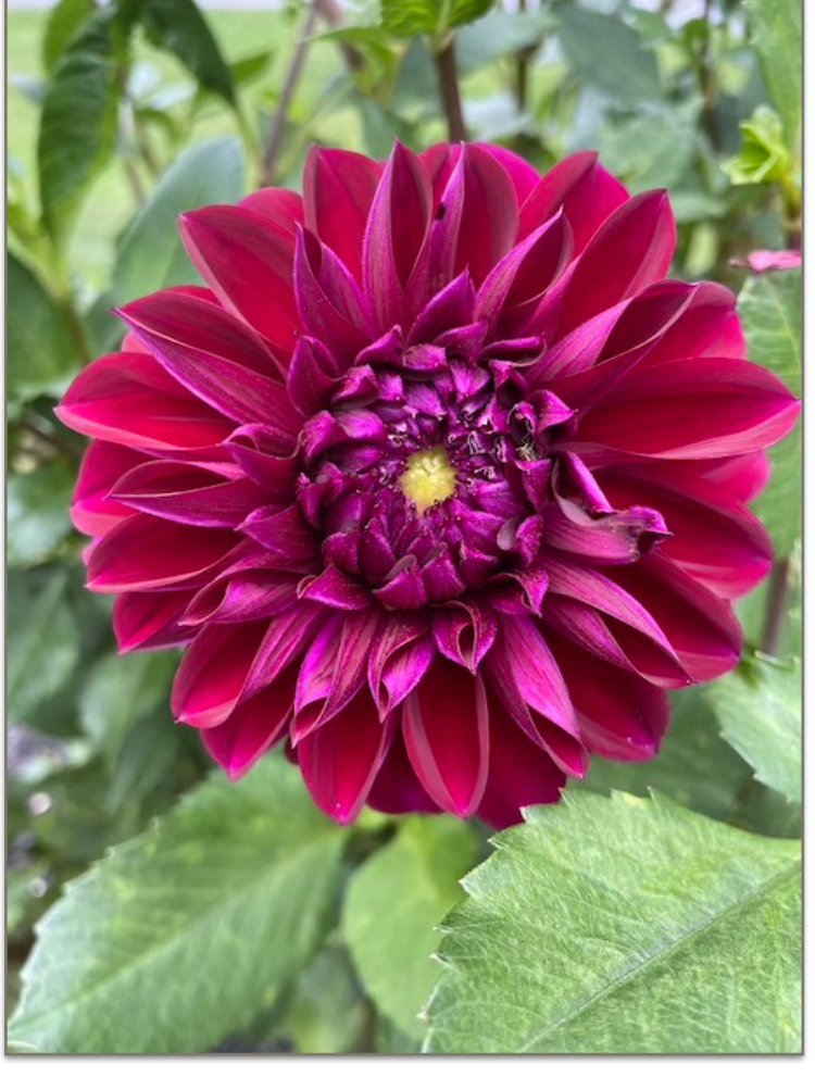
From our beautiful flower garden in 2023.