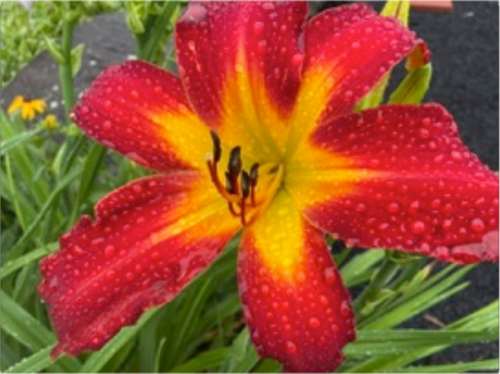
From our College Church gardens.