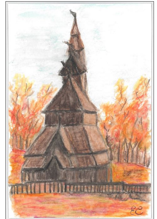
Stone church, Bergen, Norway.

"We are most like beasts when we kill. We are most like men when we judge. We are most like God when we forgive."