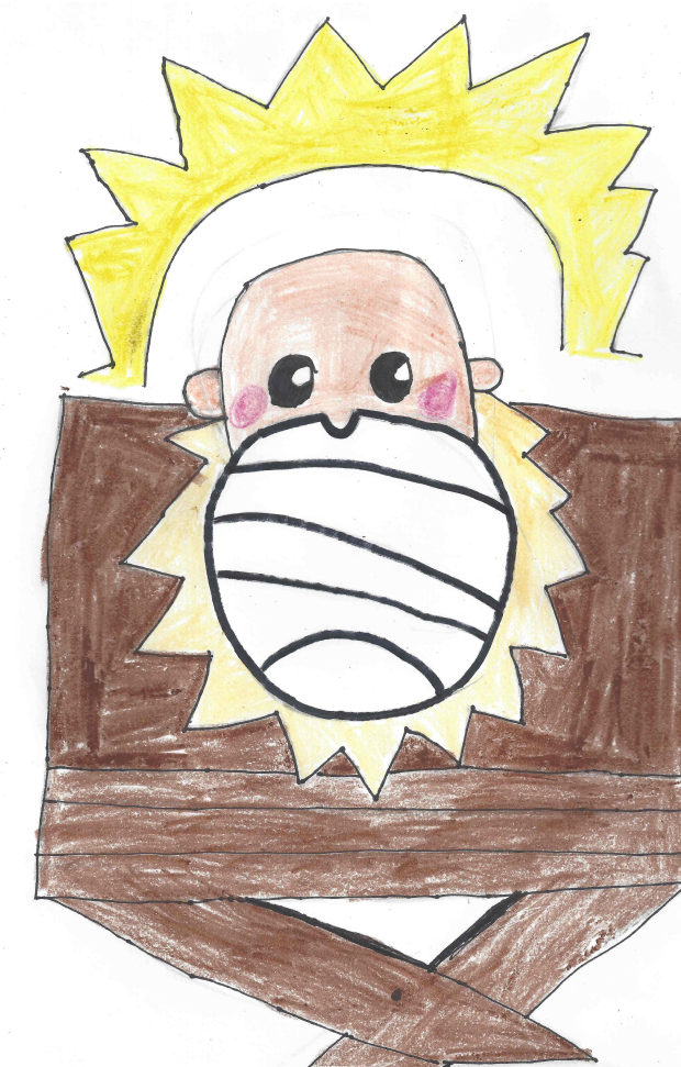
Artwork by Wyatt Aubin