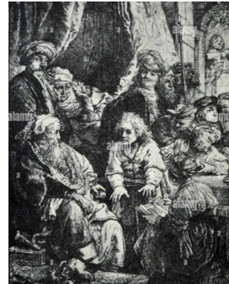
Joseph Telling His Dreams (1633) by Rembrandt van Rijn. The pastor will be preaching a series about Joseph.

COLLEGE CHURCH of Seventh-day Adventists