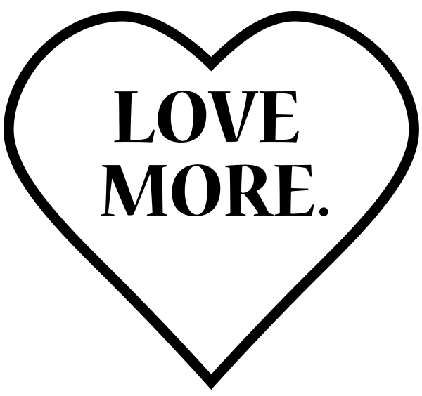
More of God. Less of Me. All of Us.