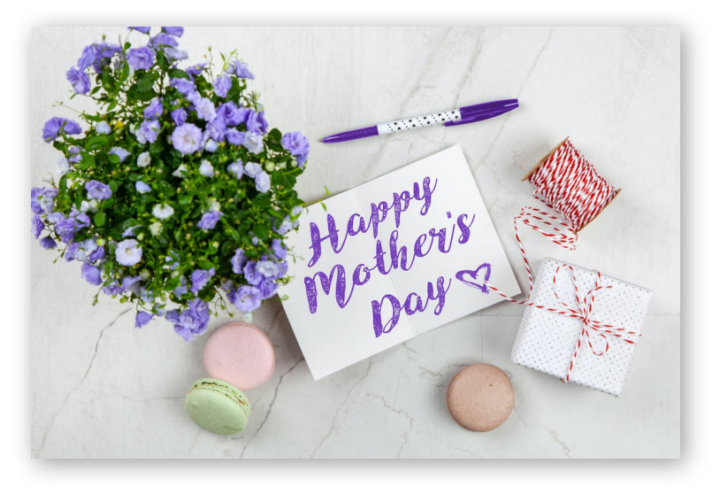
Happy Mother's Day to all our mothers!