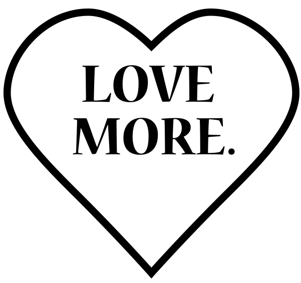
More of God. Less of Me. All of Us.