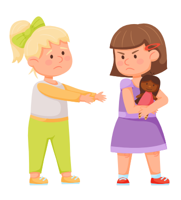
We are unwilling to share