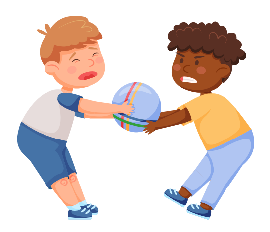
We want something that belongs to someone else