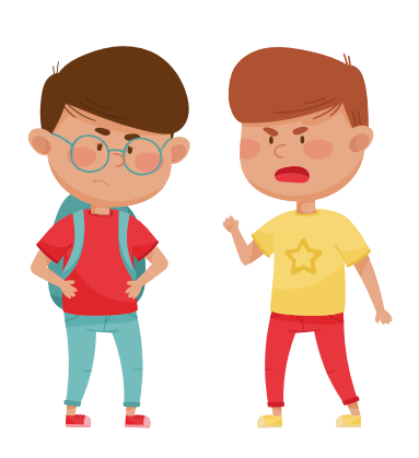
We say what we want to say without thinking about others