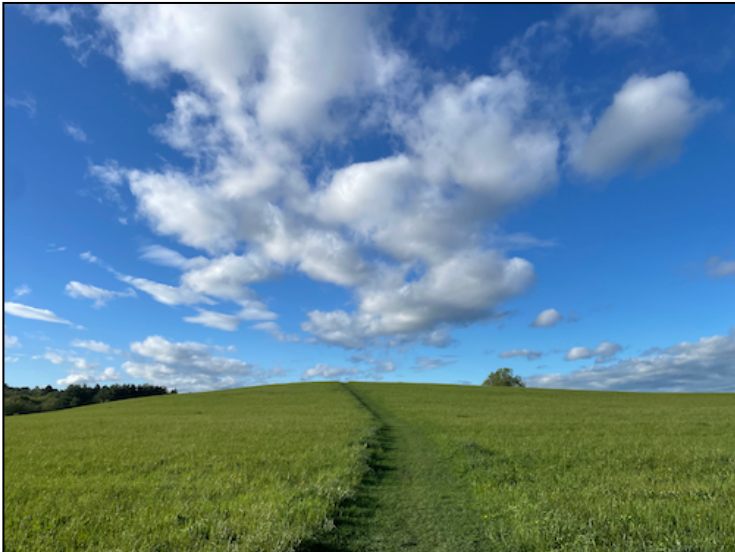
Last Sabbath the rain stopped just in time for a beautiful afternoon when this photo was taken by a College Church member.

COLLEGE CHURCH — of Seventh-day Adventists —